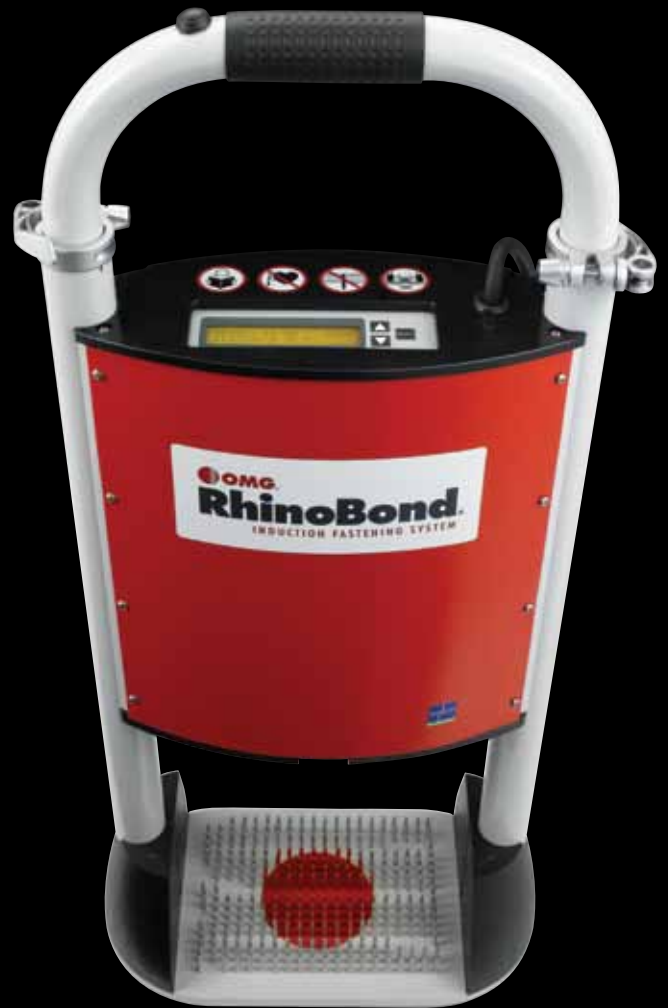
RhinoBond Portable Bonding Unit