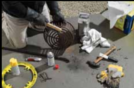
Faster & easier than rework!